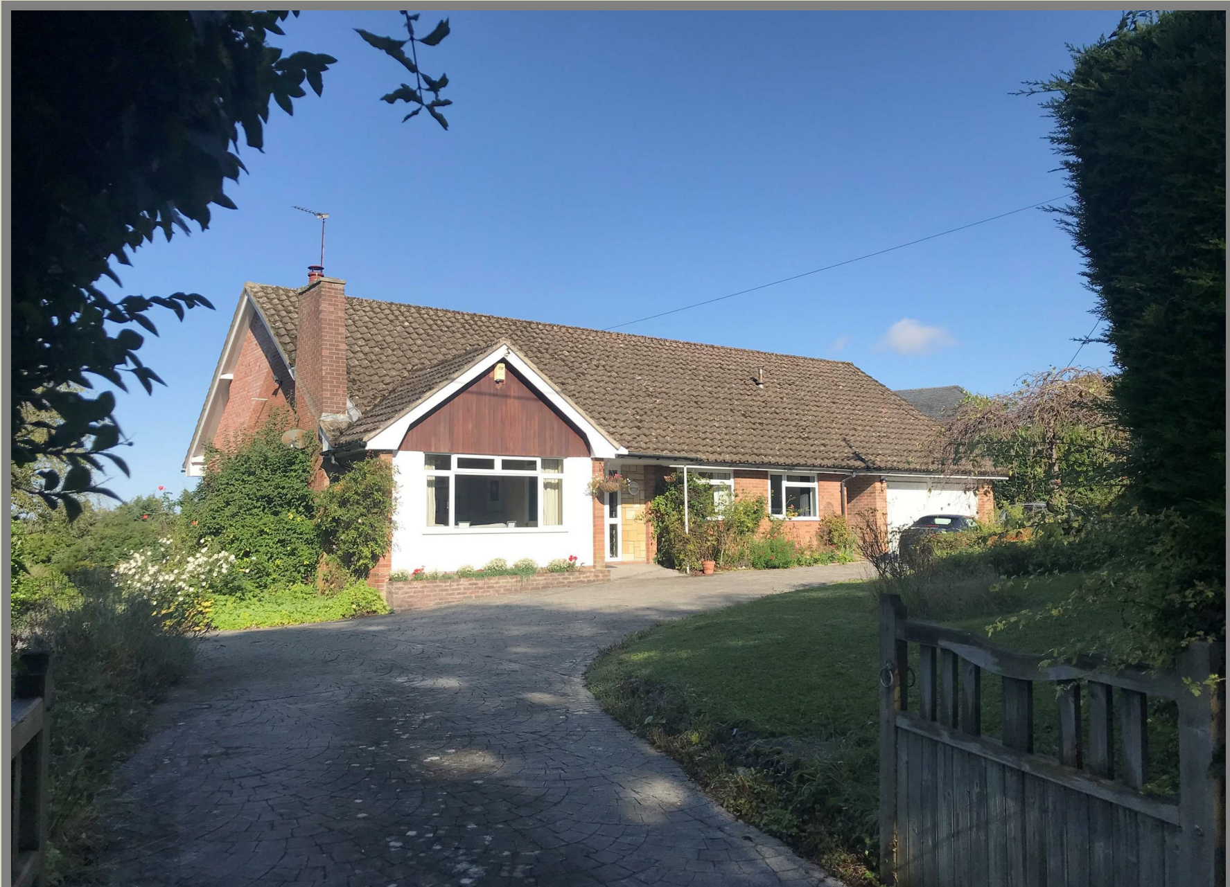
SPERANZA, Downs Road, Compton, RG20 6RE